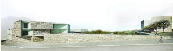
Fig. (2). Front view of the school building with the adjacent area.