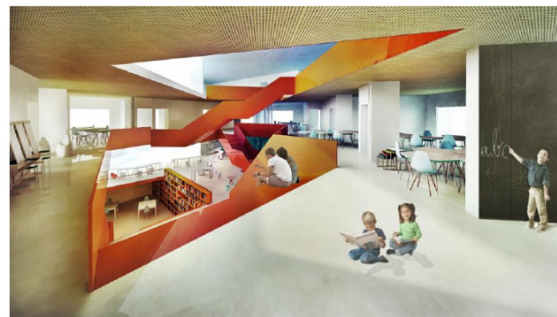
Fig. (4). Spaces for group learning.

broad issue of the use of renewable sources. Water-saving is obtained by collecting and using rainwater for irrigation of vegetable gardens, vegetation and for sanitary use. In this context, it is to note that the project is based on the use of recycled materials and components: the local stone ( breccia irpina ) used with different sizes to cover the façade and to build the coverings and the external perimeters; polycarbonate on the façade; polyester for the insulation; recycled wood to realize the outdoor furniture. The logic of recycling comes into play positively with respect to the rapidity of execution of works, based on the easy provision of the materials and on the reduction of the processing waste (with respect to this aspect, it is also envisaged to use construction technologies (reinforced concrete) dry. These aspects significantly affect the maintenance, in terms of ease and economic execution.