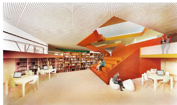
Fig. (5). Internal view of the library.