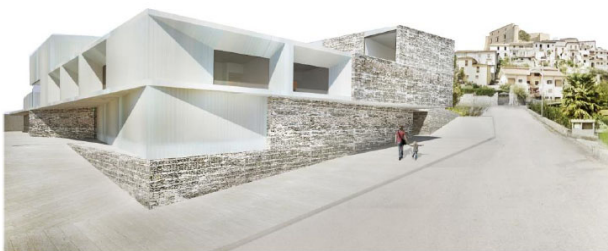
Fig. (1). Front view of the school building.

The new school building is designed as a Civic Center, an urban place characterized by spaces of relationship. There is an articulated system, in which the nursery school is in immediate contact with the garden and the educational gardens, but also connected to a large atrium, where the auditorium, the canteen and the laboratories are located. This unitary space is both a space for great events and domestic space, sub dividable and usable in everyday life. At the same altitude, the system of open and covered spaces is connected to the existing gymnasium, incorporated into the new system. From the atrium it is possible to descend towards the library and to go up towards the elementary school and then to the middle school. The rotation of the superimposed levels makes possible to create terraces and outlooks, which, together with the inclined roof, define the characteristics of an articulated building immersed in the green spaces, which recalls the castle and the hill. The idea is to have a building in the park. This fundamental goal is pursued in relation to the general aims of the "Innovative Schools" competition with respect to which specific answers have been elaborated and summarized in the proposed solution. However, these specific answers can be explored, identifying some specific themes [2 - 10]. Figs. (1 and 2) propose front views of the school building under consideration.