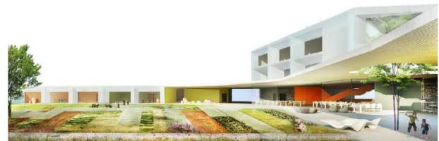
Fig. (3). The school in the park.

environment, with the landscape and with the reference context also as a didactic function, i.e. in other words the theme of the presence of usable green spaces that enrich the habitability of the place. Based on such premise, the project for the new school is conceived as a landscape project, intended as the construction of an architecture strongly related to the specific site, to the topography of the area, and to the vegetation aspects of the place. In this perspective, three fundamental choices are presented: A perceptive connection is established with the castle, whose connection with the site and the articulation of volumes is reinterpreted; an extension and an interpenetration of the natural and artificial soil is done, assigning to the full and/or inclined roofs the task of enhancing the quality of open spaces; different types of green open spaces are planned: gardens, flowerbeds, educational vegetable gardens that change with the seasons, sports pitches, cycle-pedestrian paths through the greenery, with a view to obtaining "a school in the park" (Fig. 3).