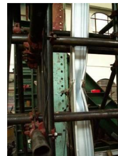
(c) instability about strong axial