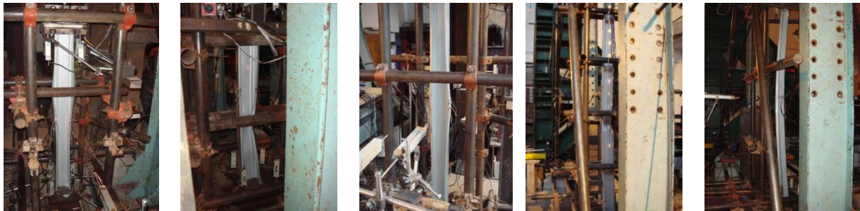
(a)SS1010-50-EC-Y-3 (b)SS1075-25-EC-X-1 (c)SS1010-100-EC-Y-3 (d)SS1075-50-EC-X-1 (e)SS1010-100-EC-Y-2

The typical buckling mode for LG550 eccentrically compressed members is shown in Fig. (3). Distortional buckling took place for the specimens bending about weak axial and load was eccentric to lip (Fig. 3a) and bending about strong axial (Fig. 3b). With the increase of the slenderness ratio, the interaction among distortional buckling and overall buckling occurred for the specimens bending about weak axial and load was eccentric to the lip (Fig. 3c) and bending about strong axial (Fig. 3d). The interaction among local buckling and overall buckling occurred for the specimens bending about weak axial and load was eccentric to web (Fig. 3e). The buckling mode for S350 and S280 eccentrically compressed members were observed to be same to the LG550 members.