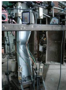
(b) instability about weak axial for medium long column