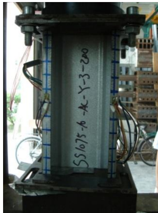
(a) stud column

The detailed distortional buckling experiments for lipped channel sections fabricated with LG550, S350, S280 steel plates can be found in reference [6 - 10]. These experiments include axially compressed members and eccentrically compressed members for lipped channel sections fabricated with LG550, S350, S280 steel plates. The eccentric experiments include bending about strong axial, bending about weak axial (eccentric to web), and bending about weak axial (eccentric to web). The overall view of compressed columns tests arrangements is shown in Fig. (1). The columns were fixed supported for axially compressed stud columns. The other column specimens were used to simulate the hinged-hinged support using two knife hinges at every end.