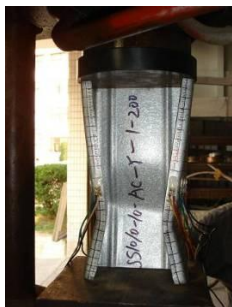
(a) stud column

The typical buckling mode for LG550 axially compressed members is shown in Fig. (2). Distortional buckling and local buckling occurred for stud columns, medium columns, and columns bending about strong axial. Distortional buckling and overall flexural buckling occurred for long members. The buckling mode for S350 and S280 axially compressed members was observed to be same to the LG550 members.