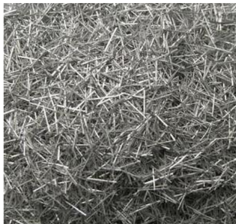
Fig. (1). Chopped steel fiber.

Each series consists of three (3) EPG concrete cube specimens, where 0% FRP is the control specimen without dispersed fiber reinforcement. Then the batches consisting of FRP were reinforced individually with 0.5%, 1%, 1.5 and 2% fibers accordingly. The f_c test was conducted on concrete cubes with a dimension of 100mm x 100mm x 100mm. The cubes were cast in a metallic mould according to CIS Interstate Standard GOST 10180-2012 [26]. After pouring the EPG concrete into the molds, the molds were covered with polythene sheets and stored at relative air humidity ( 95 \pm 5 ) % and room temperature ( 20 \pm 5 ) °C. The EPG concrete cubes were demoulded and stored in the curing cabinet after 48 hours. The f_c test was carried out on the various EPG concrete specimens on 7th, 14th, and 28th day of curing periods (D). A hydraulic press Matetest Universal Testing Machine of up to 1500 kN was used for the compression test.