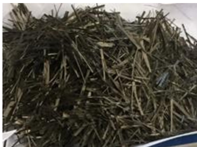
Fig. (2). Chopped basalt fiber.